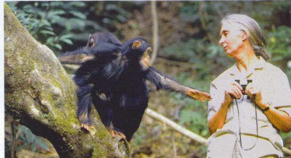
Jane Goodall in her natural habitat, with some dear friends.